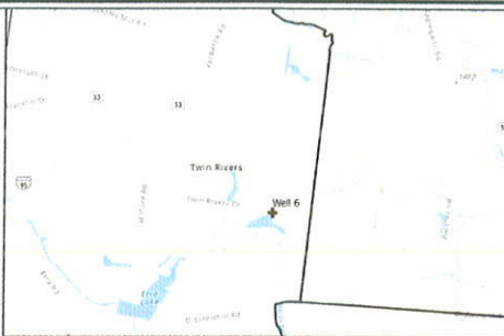
LOCATION MAP (SCALE: 1" = 2,000')